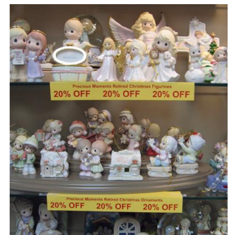
SUMMER SALE on in-store items only. Please visit our store at 8562 Mentor Ave Mentor, Ohio 44060

SHOP TODAY and help us make room for new items arriving this fall!